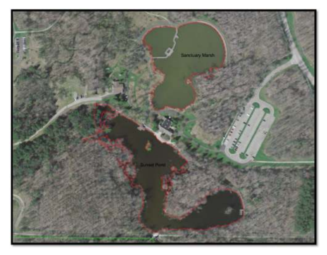
Map 1. Sunset Pond and Sanctuary Marsh in North Chagrin Reservation