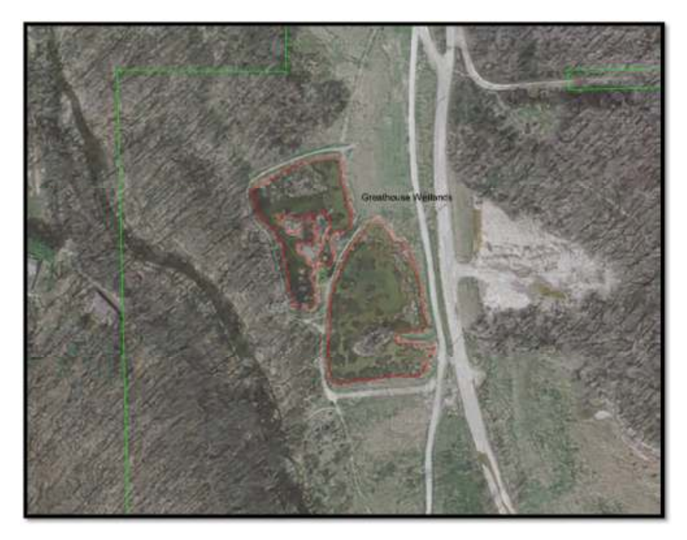
Map 3. Greathouse Wetlands in West Creek Reservation