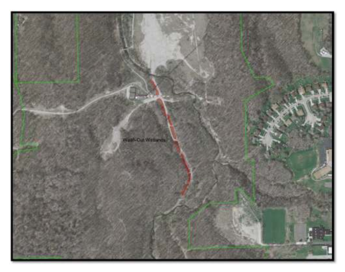
Map 4. Wash-Out Wetlands in West Creek Reservation